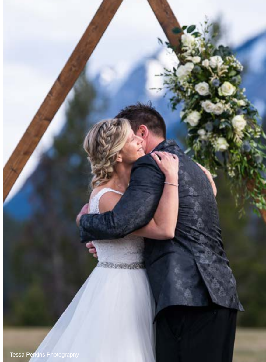
Tessa Perkins Photography