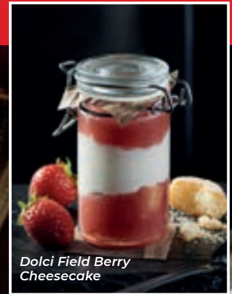
Dolci Field Berry Cheesecake