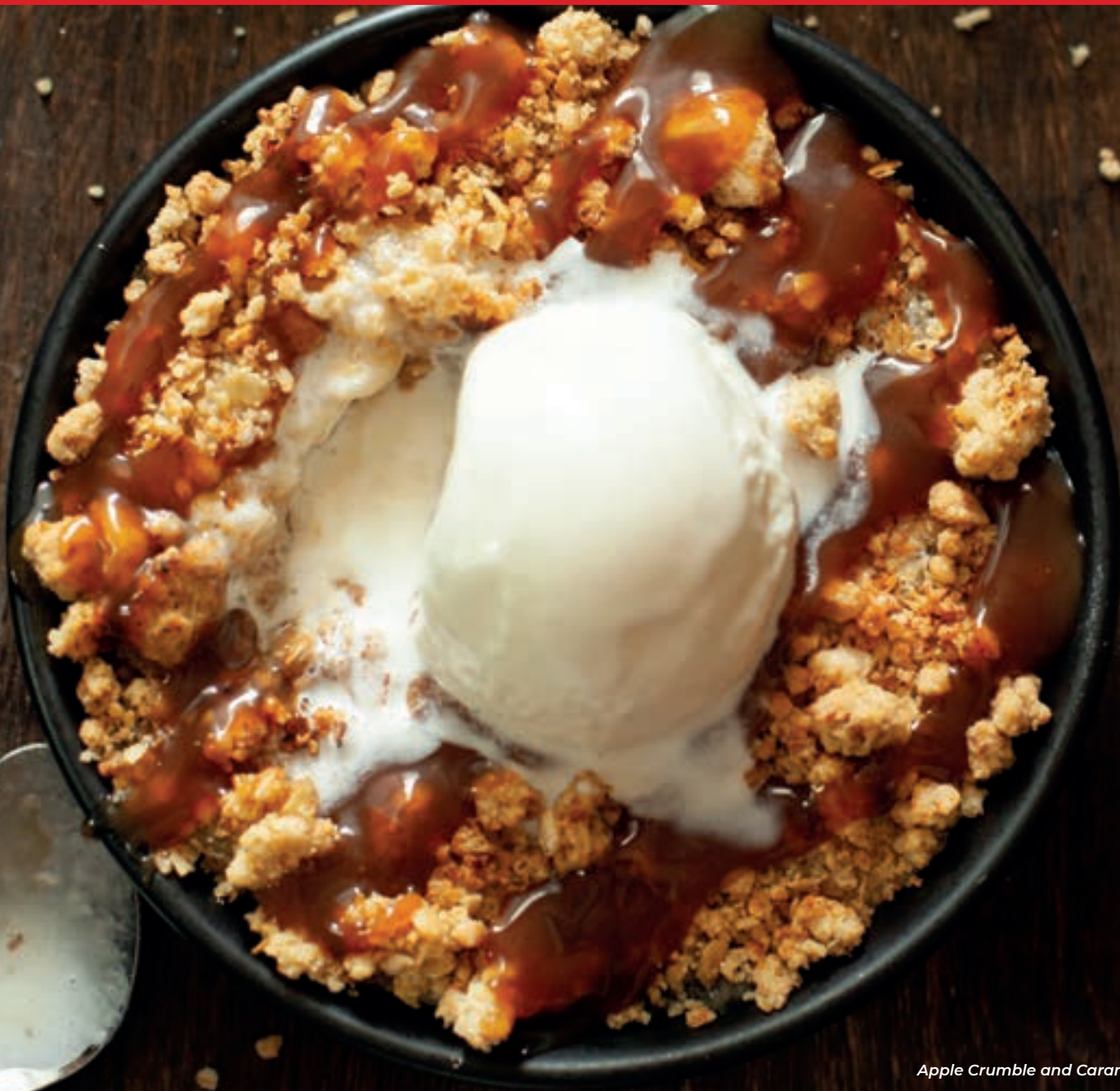
Apple Crumble and Caramel Sauce