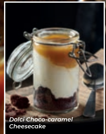
Dolci Choco-caramel Cheesecake