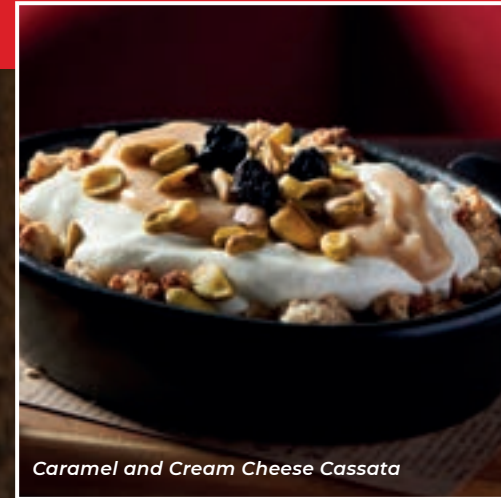
Caramel and Cream Cheese Cassata