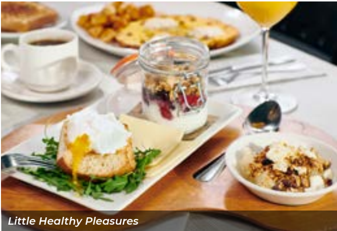
Little Healthy Pleasures