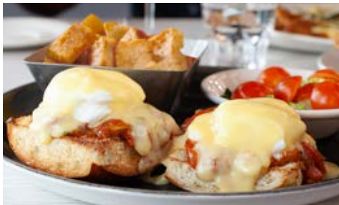
All'italiana Eggs Benedict