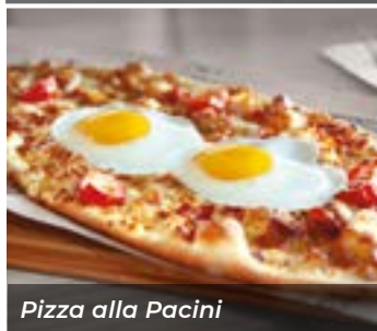
Pizza alla Pacini