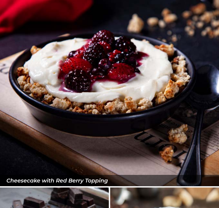
Cheesecake with Red Berry Topping