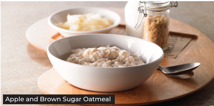
Apple and Brown Sugar Oatmeal